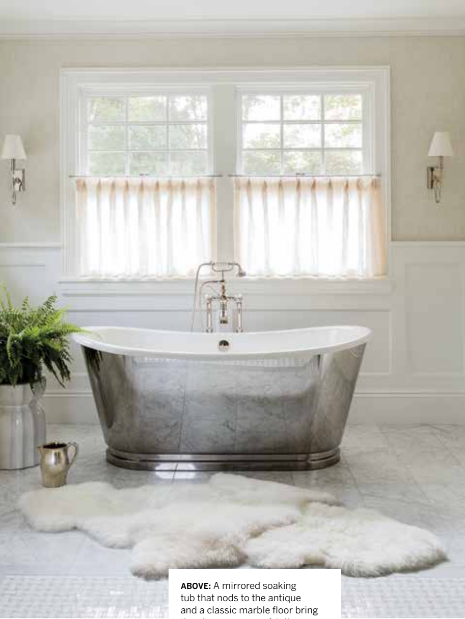
ABOVE: A mirrored soaking tub that nods to the antique and a classic marble floor bring the glamour. RIGHT: A taller backsplash in the main bathroom lends an Old World feel to the space. FACING PAGE: “Everyone looks best in blush,” says LeBlanc of the inspiration behind the main bedroom, which has a lush, layered, feminine feel; the replica bed is from Leonards New England, and the drapes are from Rogers & Goffigon.

directed the heavy lifting, including removing a big, old chimney in the kitchen to create better flow and adding a coffered ceiling with real beams for support. Venegas and Company collaborated on the owner’s wish for a white kitchen. On the second floor, a rarely used sleeping porch became part of the main suite, which shines with a feminine aesthetic and a hint of sparkle.