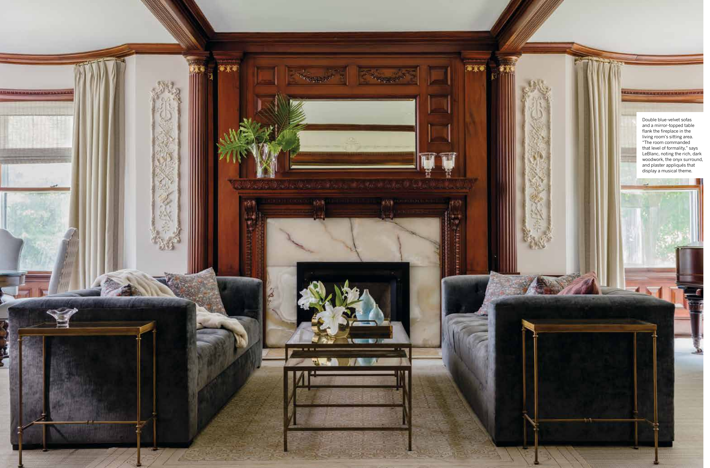
Double blue-velvet sofas and a mirror-topped table flank the fireplace in the living room's sitting area. "The room commanded that level of formality," says LeBlanc, noting the rich, dark woodwork, the onyx surround, and plaster appliques that display a musical theme.